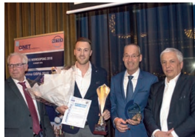
The Dutch National Best Practice Awards, organized with the support from NETEX in March, 2018