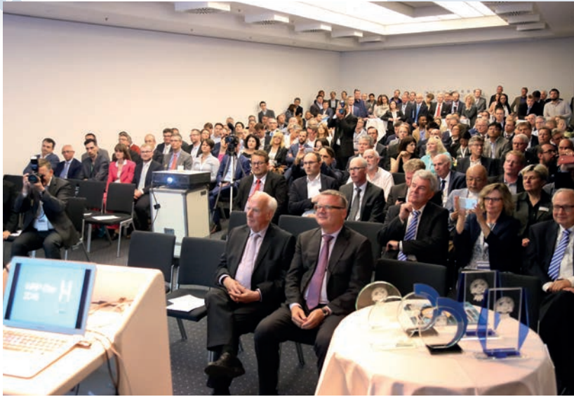
The GBPAP18 Official Ceremony

The October 19th Program will culminate with the Official Ceremony.