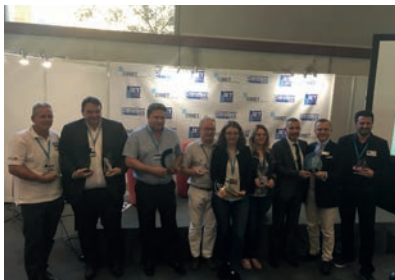
The French Best Practice Awards - JET EXPO, October, 2017

CINET's Global Best Practices Awards Program 2018 was marked by a series of outstanding National Pre-selections events on the Road to Milan (GBPAP18 Final at ExpoDetergo International), in cooperation with national PTC associations: