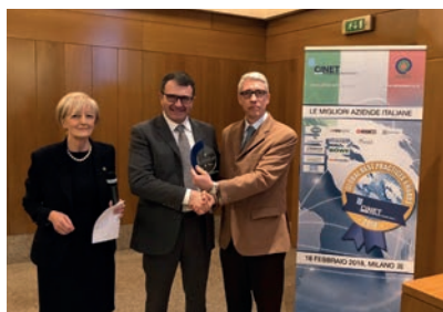
Italian Best Practice Awards, organized by Assosecco and CINET in Milan, February 2018