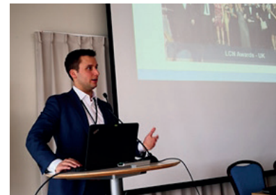
The Norway Chapter, in cooperation with NRV, took place in March 2018