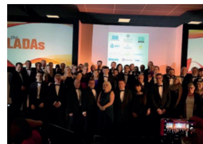
The LADAs (UK) – November, 2017

CINET would like to thank to all the National Association that have supported the global quest for bringing together the most outstanding company profiles at The Global Best Practices Awards Program 2018.