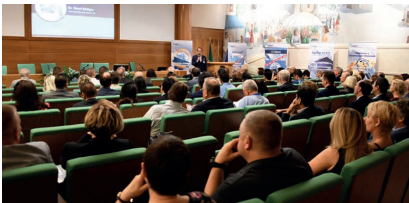
More than 150 attendees on October 18th

The CINET General Assembly 2018 took place on October 18th at the Assosecco headquarters at Unione Confcommercio, Palazzo Castiglioni in Milan, Italy.