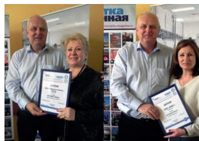
The Russian pre-selections hosted in Moscow, in cooperation with The Russian Laundry & Drycleaning Association