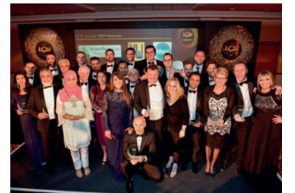
LCN Awards (UK) – October, 2017