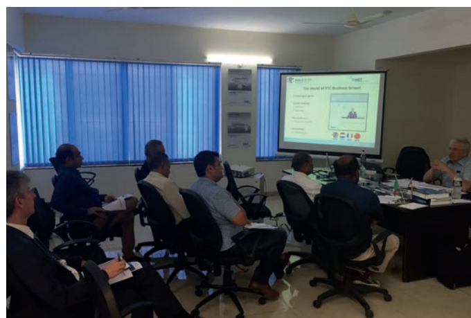
Workshop Wetcleaning India