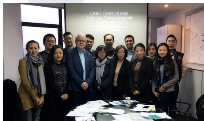
Workshop CERCLEAN® Indonesia

the various members the research institutes, suppliers (which constantly develop innovations) and other associations are highly valuable partners to work with in constantly developing the knowledge database cost-effectively. CINET makes sure new technologies and innovations are constantly included in the courses, described in a neutral, objective way. Furthermore, members are invited to provide brand specific input for the suppliers tabs within the program. This is complementary information so users can review product specific information or compare different technologies to learn what technology fits best for their business model.