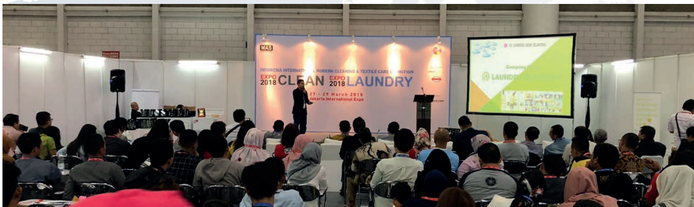
PTC Workshop Indonesia