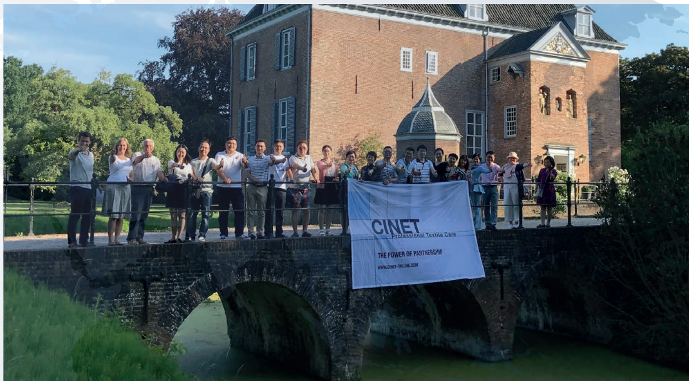
Training CLA at Castle Ophemert, The Netherlands