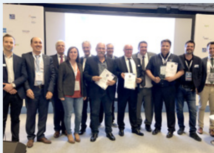
The successful French Best Practices Awards during JET EXPO 2019 in Paris, France. The winners of the ITS segment, together on the stage with the Sponsors and the French Preselections National Jury.