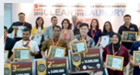
Winners of the Indonesian Best Practices Awards 2019