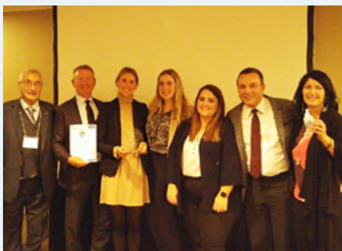
The Canadian "Best Practices Awards" Overall winner