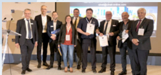
JET EXPO France 2019