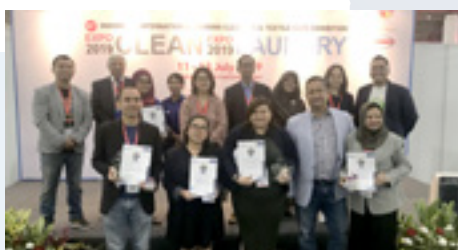
Winners of the South East Asia Awards 2019