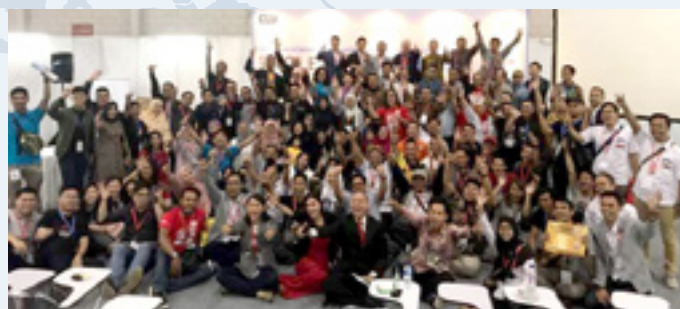
ASLI Indonesia 2019