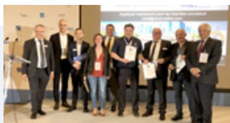
Preselection 2019: JET EXPO Best Practices Retail 2019

The Global Best Practices Awards Program 2019-2020 will unite hundreds of participants from over 45 countries, including National Pre-selection events in a number of countries.