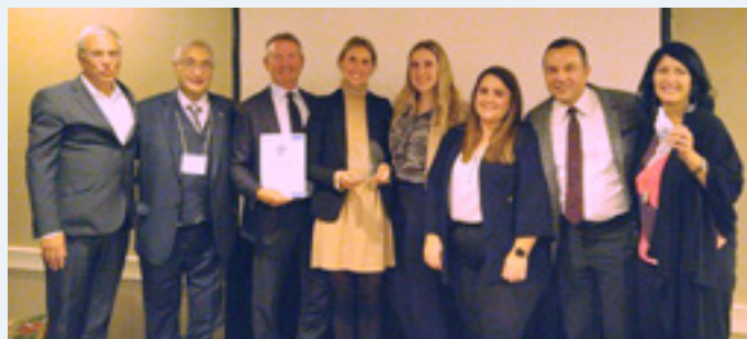
CFA Canada 2019