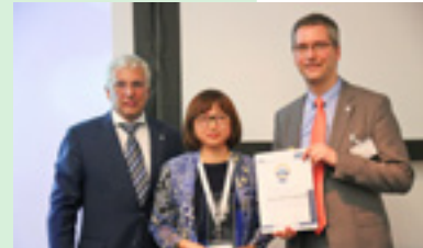
Best Overall Award TC: Beijing Fornet Laundry Services from China