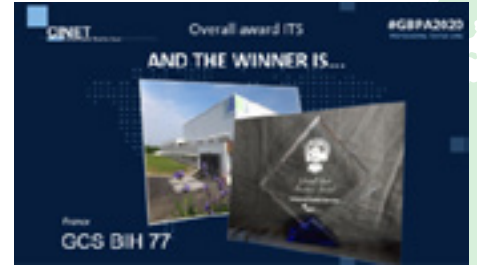
The Overall Award Category ITS was received by GCS BIH77 from France because of their outstanding focus on quality, CSR and sustainability.